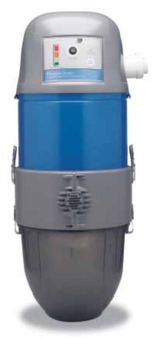
Platinum Series Model (disposable bag)