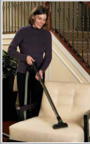
The deluxe AirVac tool kit includes a convenient horsehair bristle attachment that makes cleaning upholstery a breeze.