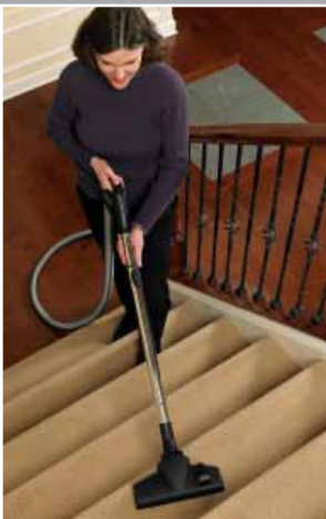
Stairs are no problem with AirVac's adjustable carpet/floor tool. AirVac tool and brush attachments come in a variety of shapes and sizes custom designed for specific uses.

But don't take our word for it. Ask builders, installers and home owners about AirVac power, value and reliability. They'll tell you why AirVac has been the industry leader in designing and manufacturing central vacuum systems. We've revolutionized home vacuuming with superior technology, reliability and value. All this because at Linear we're committed to quality.