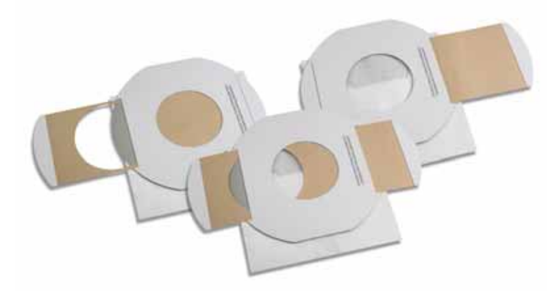
The Platinum's Series unique disposable paper bags have a sliding top that traps and keeps all the dust and debris where it belongs; in the bag.

In addition to superior cleaning, both the Platinum and Red Series AirVacs' have been engineered with the end-user and installer in mind. The power unit now has intake ports on either side allowing for more flexibility with installation – and a translucent debris bucket, located on the bottom of the unit, provides easy access for removal of collected material.